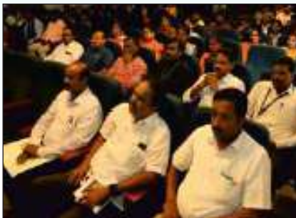
Participants of the Conclave