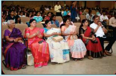
Section of Participants