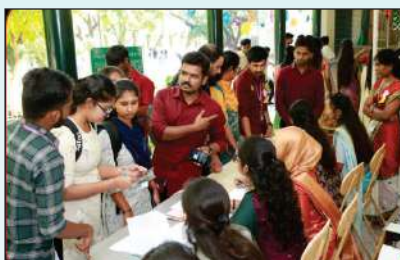
Registration of Delegates