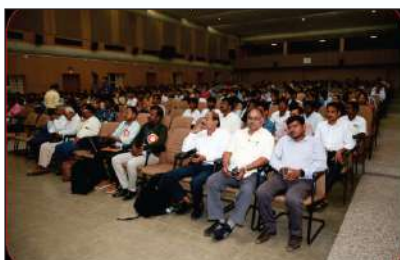
Section of Delegates