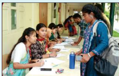
Registration of Delegates

The National Conference on “Current Scenario of Indian Economy-Achievements and Challenges” was successfully conducted on 28.02.2025 at PSGCAS, GRD Auditorium. Four technical sessions were provided for paper presentation and discussion, based on the sectors and themes on which the papers were presented. The conference provided a platform for experts, researchers, students and academicians to discuss the Current Scenario of Indian economy and the trends and growth associated with different sectors - Primary (Agriculture), Secondary (Manufacturing) and the Tertiary sectors(Service).