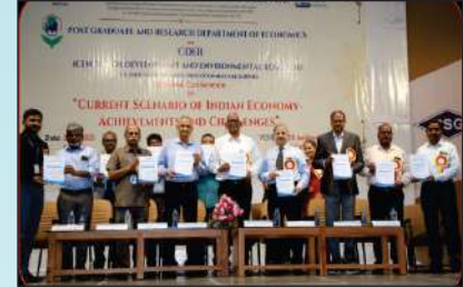
Release of Conference Souvenir