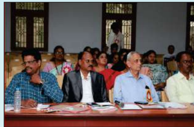
Experts in Technical Session